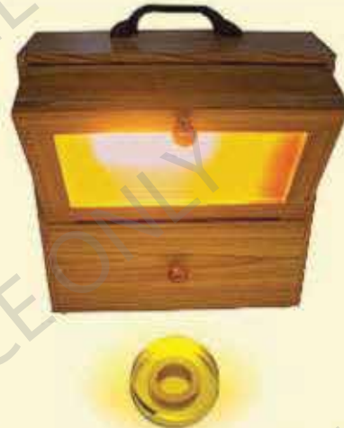
GMT monochromatic lamp with optical flat

In order to obtain utmost reflectivity from a lapped surface for light band interpretation, it is generally required to hand polish sample parts briefly after work has been lapped. GMT polishing stands are made to effectively handle a fine grade polishing paper; holding it absolutely tight to prevent rounding the edges of the work, yet permitting easy access to a new section of paper when desired. The stand is equipped to take a standard role of polishing paper.