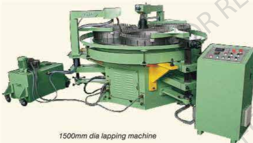
1500mm dia lapping machine