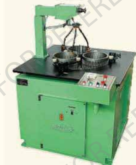
900mm dia lapping machine

Lap plates are manufactured from close-grained alloy cast iron, stress relieved after pre-machining and finally finish-machined and lapped in position.